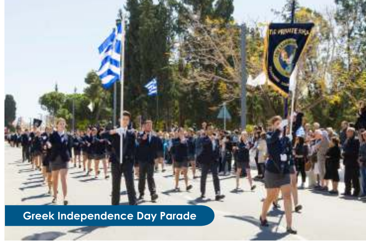
Greek Independence Day Parade