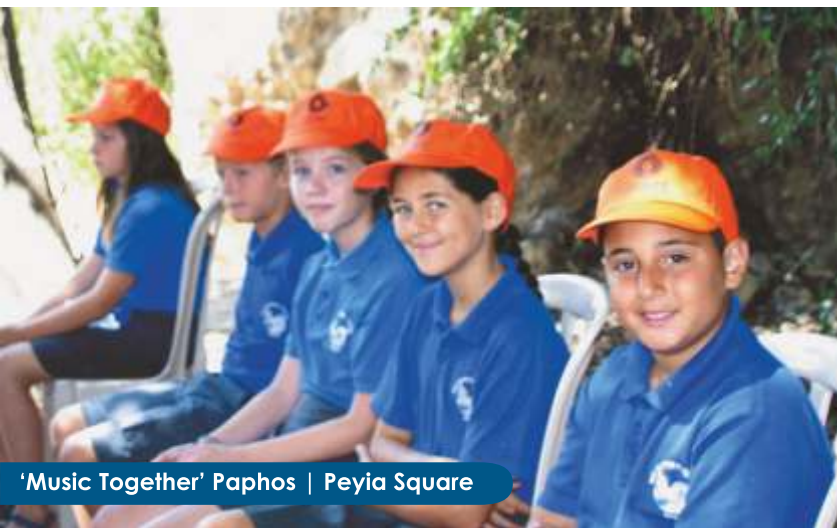
'Music Together' Paphos | Peyia Square