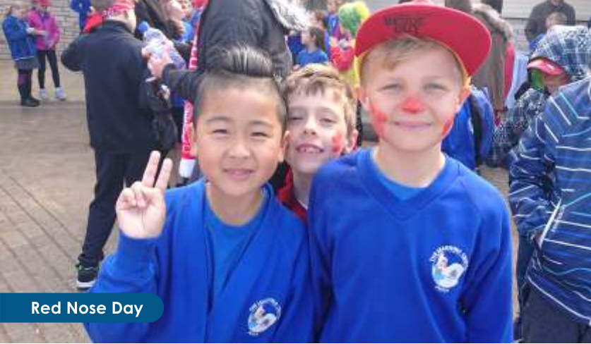
Red Nose Day