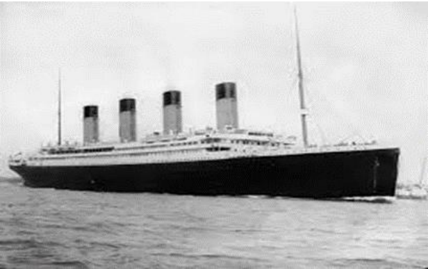
Titanic setting sail from Southampton